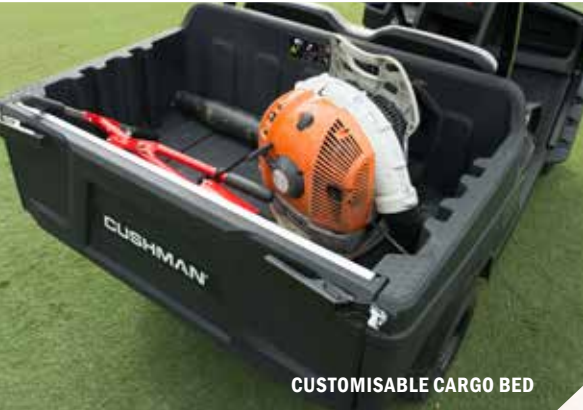
CUSTOMISABLE CARGO BED