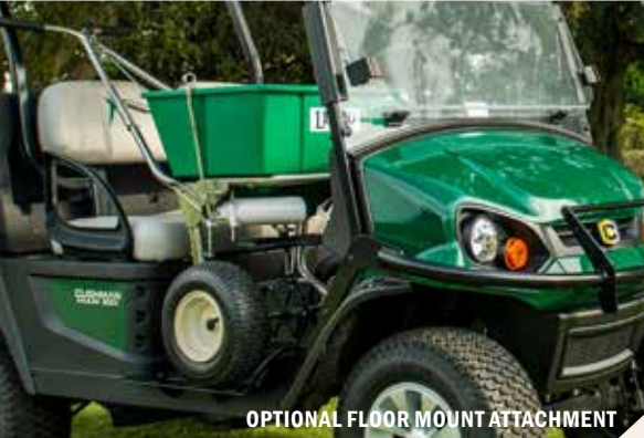
OPTIONAL FLOOR MOUNT ATTACHMENT